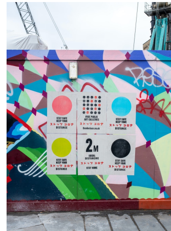
Processing the Pandemic