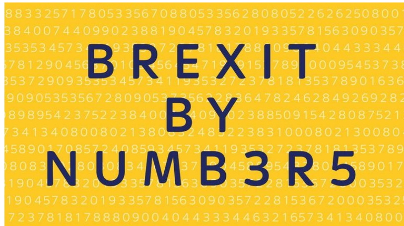
Rise of Data Journalism

Why Should I care? In the post-truth era you have a vital role to play in using data to tell powerful, engaging and accurate narratives. You are sitting on a goldmine. Now, let's explore how to use it.